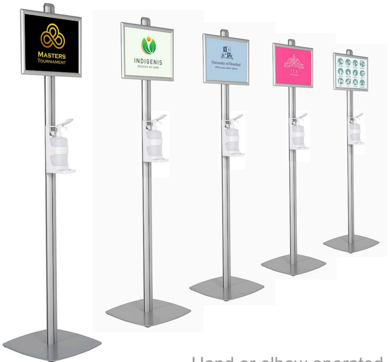
Hand or elbow operated