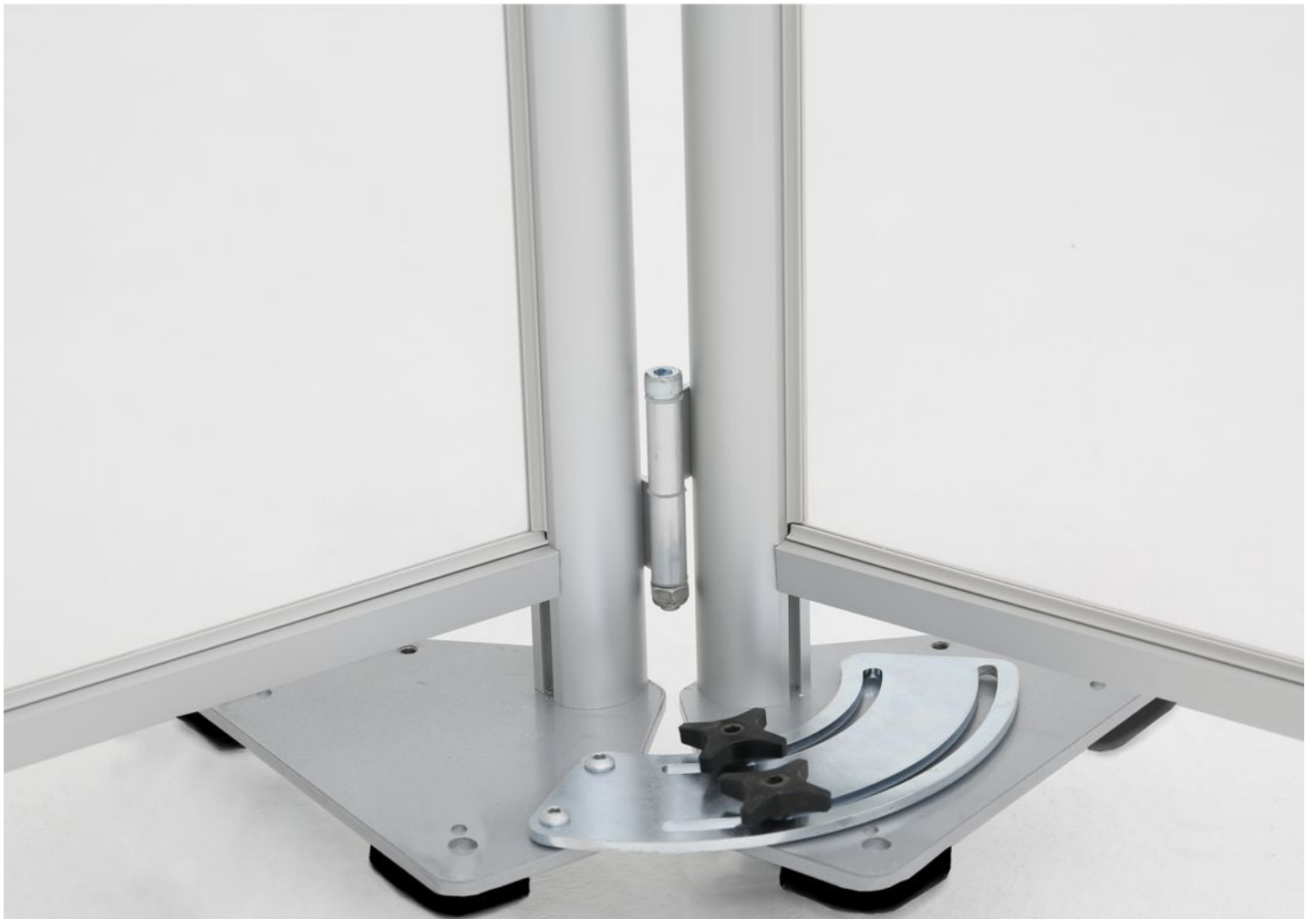
Freestanding hinged office screen with rubber glide feet, showing angle-lock device