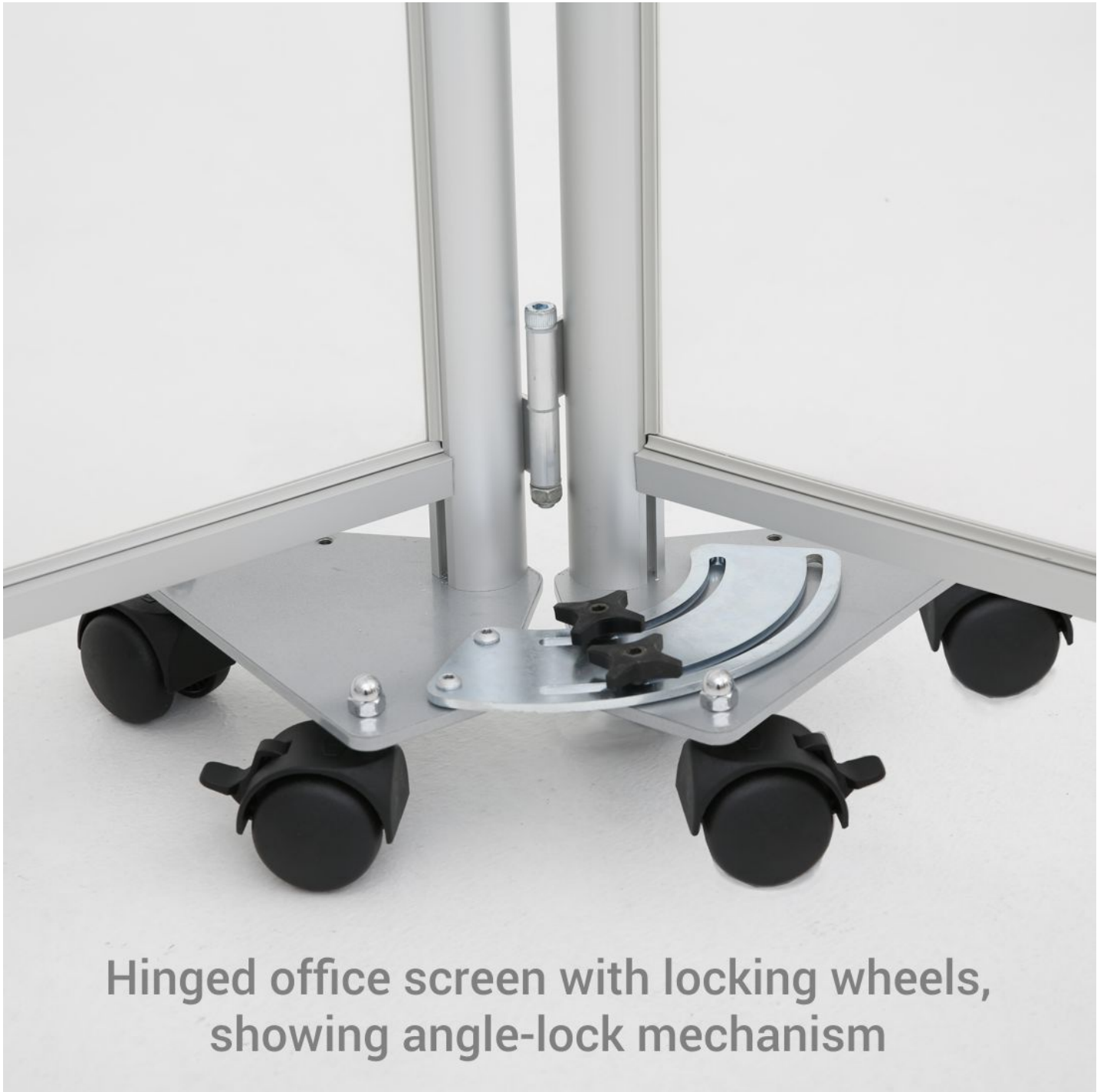
Hinged office screen with locking wheels, showing angle-lock mechanism