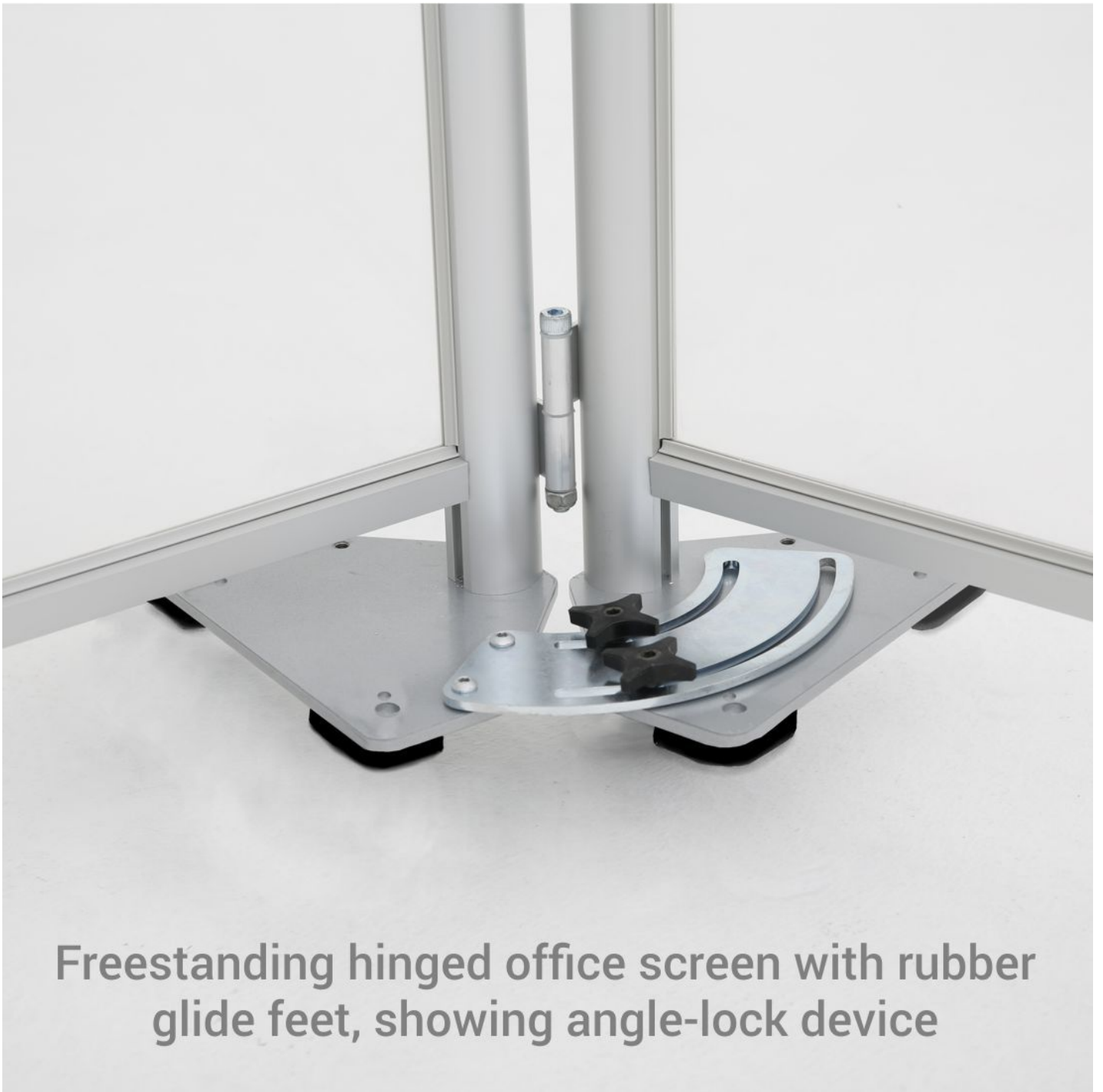
Freestanding hinged office screen with rubber glide feet, showing angle-lock device