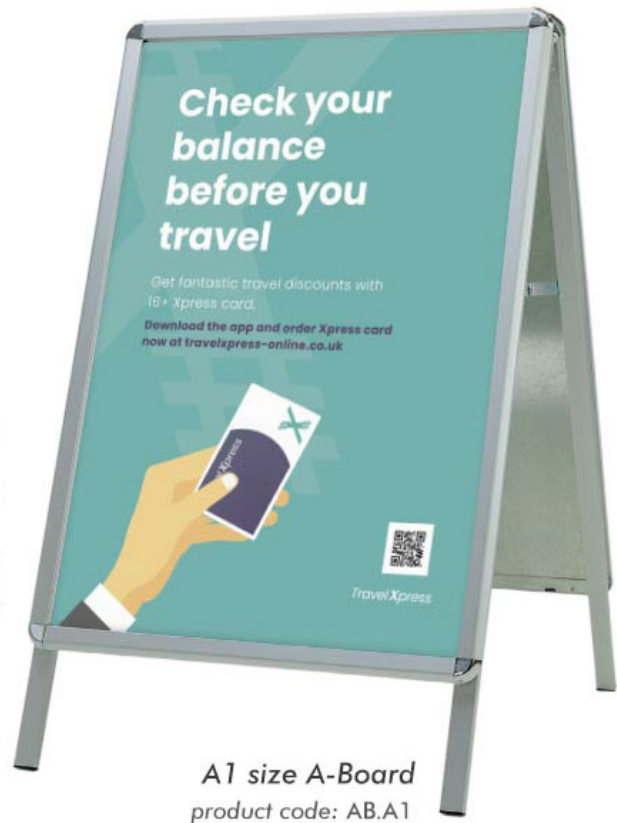
A1 size A-Board product code: AB.A1