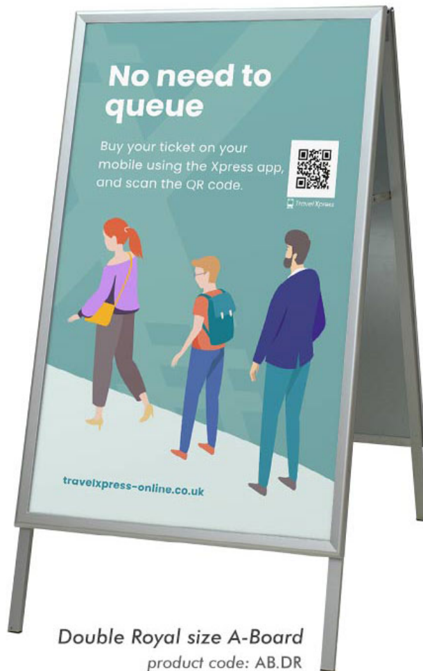
Double Royal size A-Board product code: AB.DR